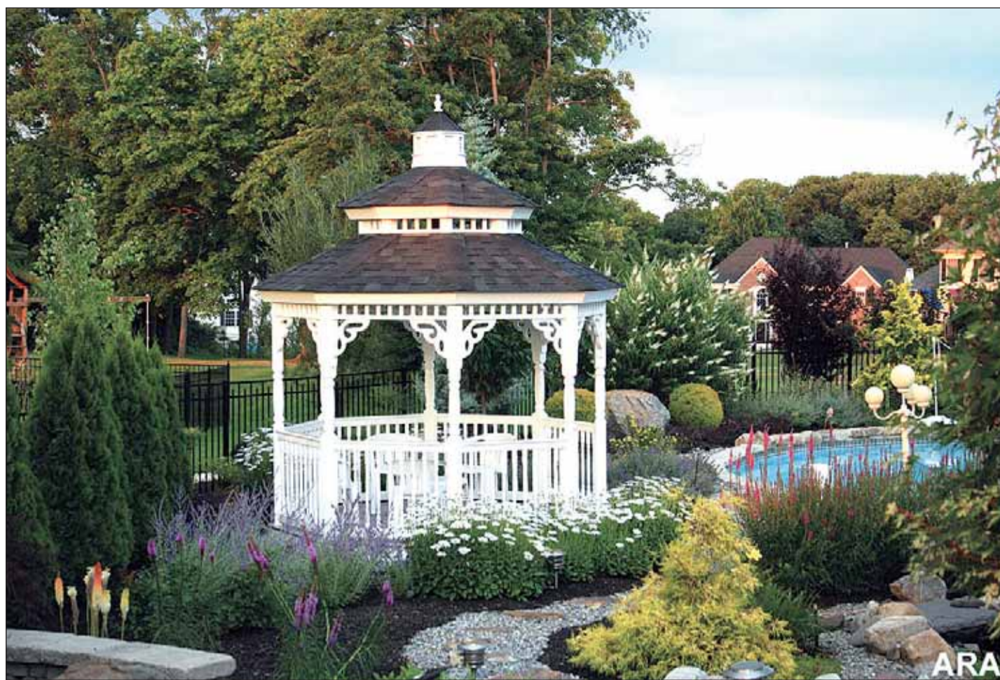
Enjoy indoor comforts outside in a custom-made gazebo.